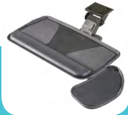
Myriad™ with FastAction Precision Arm MFP21