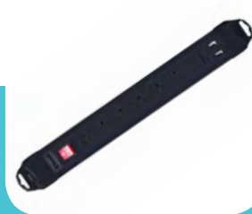
Power Receptacle PSSM-6-2