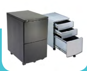
Mobile Pedestal 500MP and 502MP