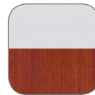
Silver Base (S) Cherry Top (CH)