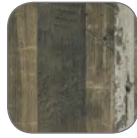
Reclamation Maple (LM)**◆