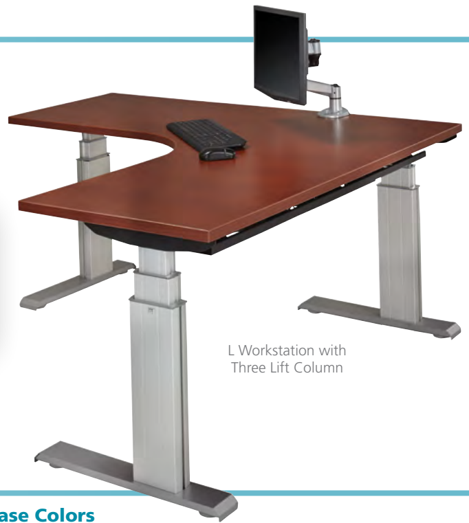
L Workstation with Three Lift Column

See Spec Book for complete specifications: raproducts.com/price