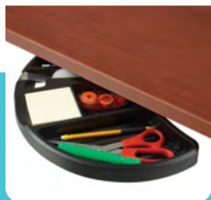
Swivel Pencil Tray 300PTB