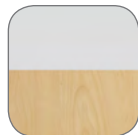
Silver Base (S) Hardrock Maple Top (HM)