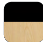
Black Base (B) Hardrock Maple Top (HM)