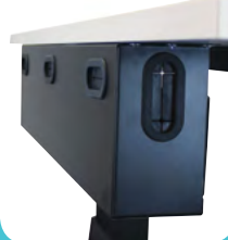
Wire Management Box XWMB