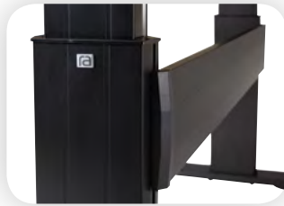
Optional cross support available