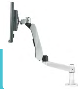
Hover Series 2 Monitor Arm HS3111