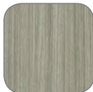
Concrete Groovz (CG)**◆