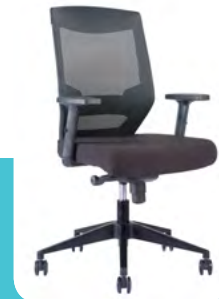
FCATBBB Task Chair