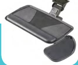
Myriad™ with FastAction Precision Arm MFP21