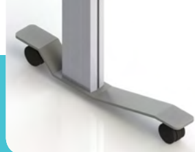
Caster Foot add - C to item number