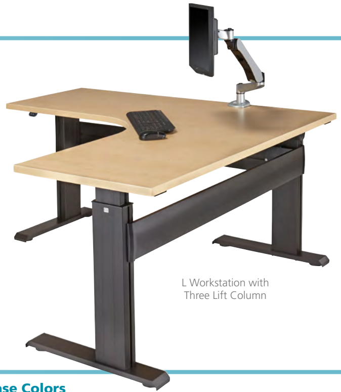
L Workstation with Three Lift Column