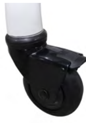
Optional Omega Casters