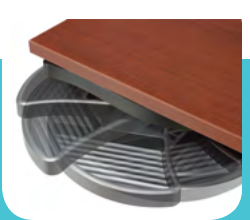
Swivel Pencil Drawer 300PTB