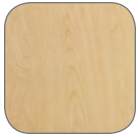
Hardrock Maple (HM)

Featuring ten laminate colors with coordinating edge band options. High-pressure laminate and custom colors available.