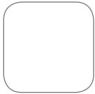
Galaxy White (GW)

**Driftwood, Concrete Groovz, and, Merapi, Reclamation Maple have Graphite edge banding