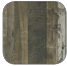
Reclamation Maple (LM)**