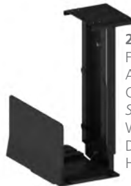
202CPU Fixed Under Desk Adjustable Steel CPU Holder Supports 40 lbs. W: 3-1/8" to 5-1/4" D: 14" H: 9" to 18-3/4"