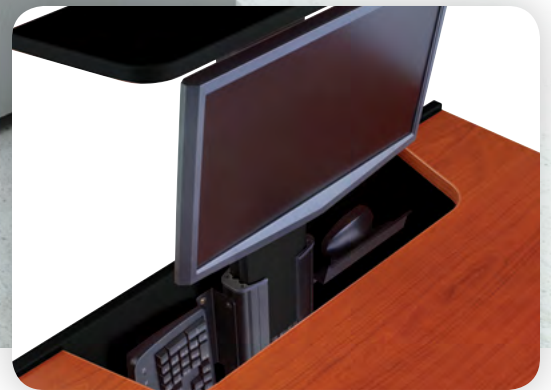
Conveniently store keyboard and mouse; lower monitor for clear line-of-sight.