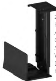
202CPU Fixed Under Desk Adjustable Steel CPU Holder Supports 40 lbs. W: 3-1/8" to 5-1/4" D: 14" H: 9" to 18-3/4"