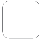
Galaxy White (GW)

**Driftwood, Concrete Groovz, and Merapi have Graphite edge banding