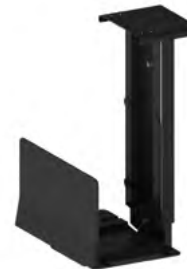
203CPU Fixed Under Desk Adjustable Steel CPU Holder Supports 40 lbs. W: 5" to 8" D: 14" H: 9" to 18-3/4"