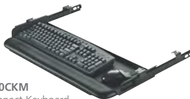
2450CKM Compact Keyboard and Mouse Drawer