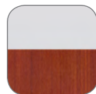
Silver Base (S) Cherry Top (CH)