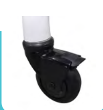
Optional Omega Casters