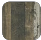
Reclamation Maple (LM)**◆