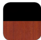
Black Base (B) Cherry Top (CH)

(Only Available on Standard 24" and 30" Configurations)