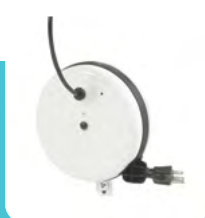
Optional 20' Retractable Power Cord 52294