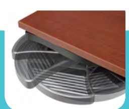
Swivel Pencil Drawer 300PTB