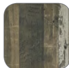
Reclamation Maple (LM)** ◆