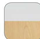
Silver Base (S) Hardrock Maple Top (HM)

◆ Includes 4EVERedge™ edge banding for straight line worksurfaces