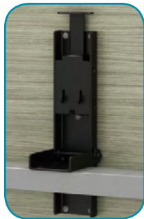
Easy-to-operate flip table features built-in safety.