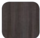
Driftwood (DW)** ◆