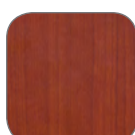
Cherry (CH) ◆