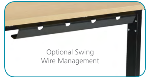
Optional Swing Wire Management