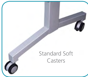
Standard Soft Casters