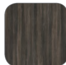
Merapi (ME)** ◆