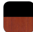
Black Base (B) Cherry Top (CH)

(Only Available on Standard 24" and 30" Configurations)