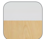
Silver Base (S) Hardrock Maple Top (HM)