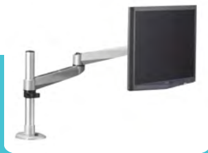
Hover Series 2 Monitor Arm HS1121