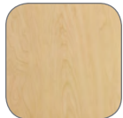
Hardrock Maple (HM) ◆

Featuring ten laminate colors with coordinating edge band options. High-pressure laminate and custom colors available.