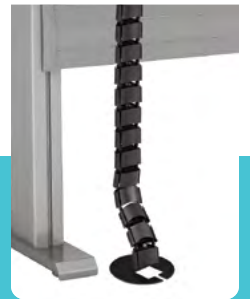
Flex Wire Management FCM490