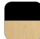
Black Base (B) Hardrock Maple Top (HM)