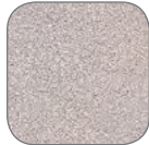
Gray Matrix (GM) ◆◆◆