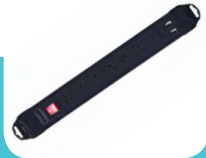
Power Receptacle PSSM-6-2