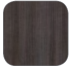
Driftwood (DW) ◆◆