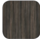
Merapi (ME) ◆◆