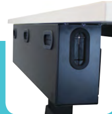
Wire Management Box XWMB