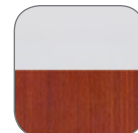
Silver Base (S) Cherry Top (CH)