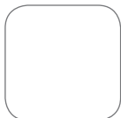
Galaxy White (GW) ◆

◆ Includes 4EVERedge™ edge banding for straight line worksurfaces ◆◆ Driftwood, Concrete Groovz, and Merapi have Graphite edge banding ◆◆◆ Gray Matrix has Black edge banding