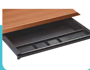
Pencil Drawer 100PDB