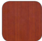
Cherry (CH) ◆