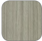
Concrete Groovz (CG) ◆◆