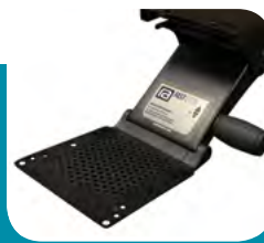
CFP21/S FastAction Compact articulating arm