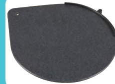
2000EM Swivel Mouse Tray