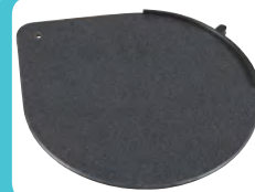
2000EM Swivel Mouse Tray