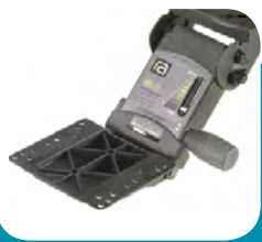
FP23/S FastAction Precision articulating arm