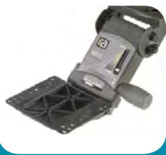
FP23/S FastAction Precision articulating arm