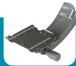
FSS26/S FastAction Sit/Stand articulating arm