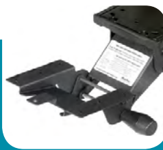
VS23/S Value Swivel articulating arm