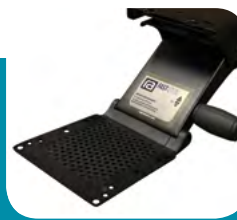
CFP21/S FastAction Compact articulating arm